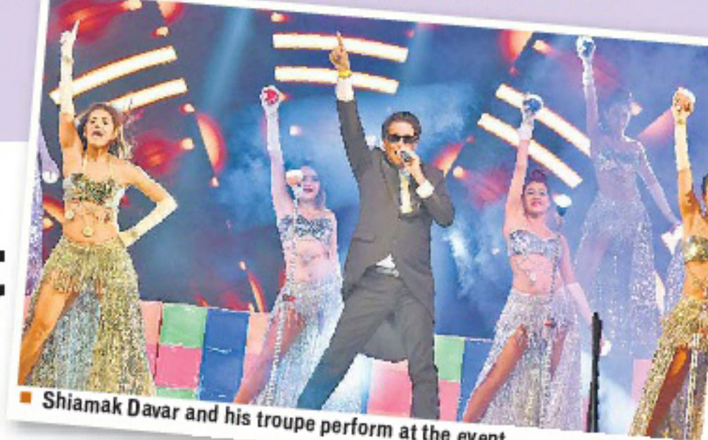
■ Shiamak Davar and his troupe perform at the event.