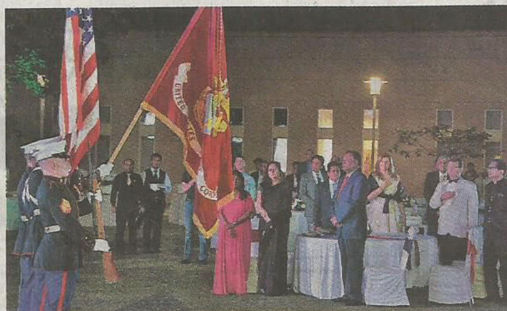
Officials and guests pay tribute to the CRPF personnel who lost their lives in the terror attack at Pulwama, at U.S. Consulate on Friday